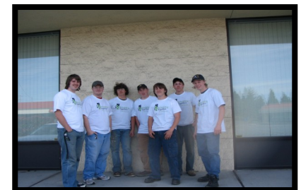
School to Apprenticeship Class 2006