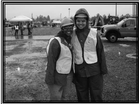
The School to Apprenticeship Programs students volunteer & participate in Construction Career Day.

If you feel you need help completing the application form or need more guidance in the application process, contact Trudy Poole at 253.552.2542.