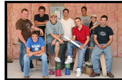
Get Electrified & Frame Your Future 2005